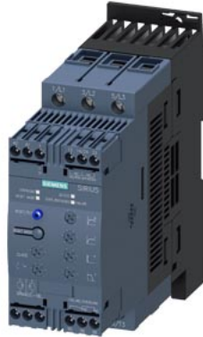
SIRIUS soft starter S2 72 A, 37 kW/400 V, 40 °C 200-480 V AC, 110-230 V AC/DC Screw terminals