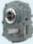
The Original SMR Series