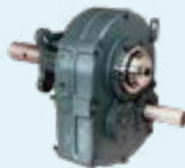
The Eliminator SCSMR Series