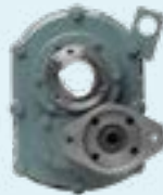
Hydraulic HYSMR Series