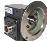
Flange Input Hollow Bore Output