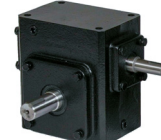
Shaft Input Shaft Output Left Hand Output