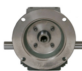
Flange Input Shaft Output Double End Output