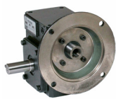
Flange Input Shaft Output Left Hand Output