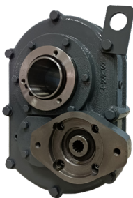
Original Shaft Mount Reducer Hydraulically Powered

For more details, visit wwec.co/gearboxes