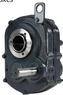
Eliminator Shaft Mount Reducer